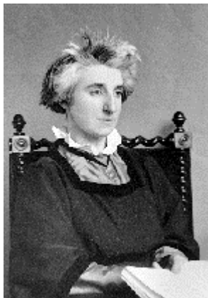
Margaret Huggins (1848-1915)